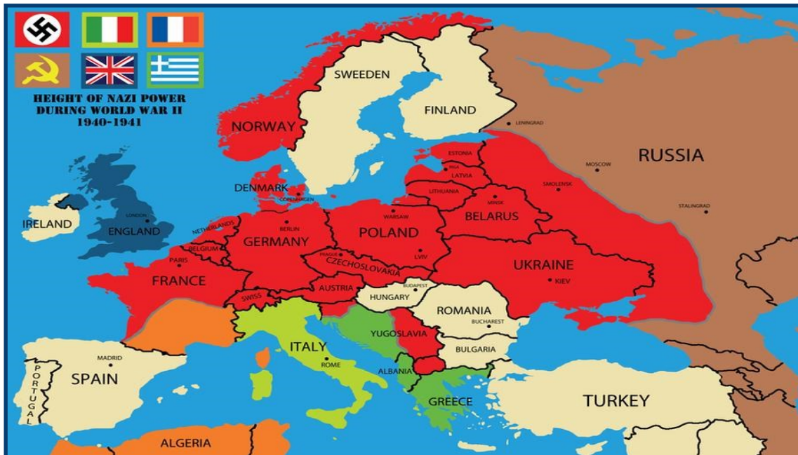
This map shows the control the German Nazi party had over Europe during World War 2 - the areas in red were under German Occupation.